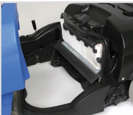
The large hopper is easy to remove for emptying, and provides total access to the main broom and large dust filter.