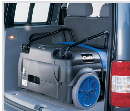
The BSW 28 is very compact and easy to transport thanks to the fold-down handle.