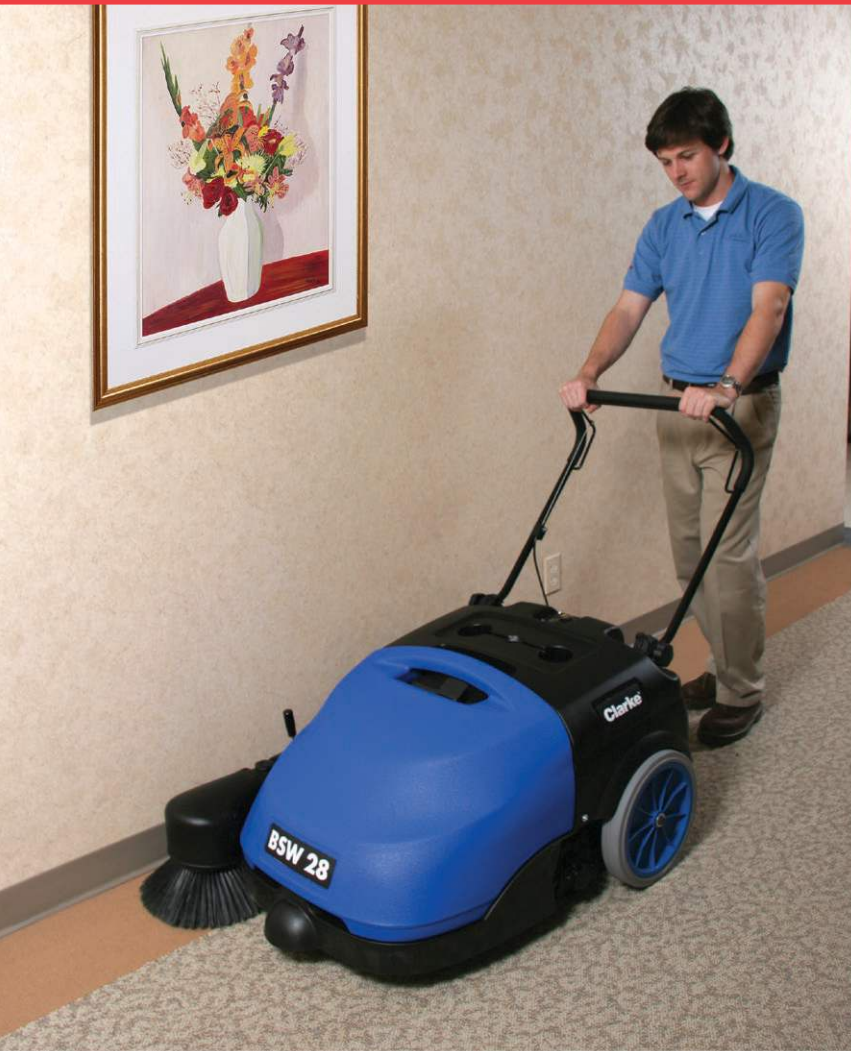
The active side broom allows for close edge cleaning capabilities both indoors and outdoors.

Whether you are sweeping carpet or hard floor, the BSW 28 sweeper has the performance for both. The BSW 28 is designed to be both rugged and versatile. Powered by a gel battery, the BSW 28 has a 28 in. sweeping path, self-propelled traction, and active dust control. The active side broom on the BSW 28 sweeps even the smallest debris and dust from the walls edge into the large main broom path for placement into a large hopper. Large traction wheels provide smooth operation. The BSW 28 is very quiet at only 59 dB A, which allow sweeping in quiet areas.