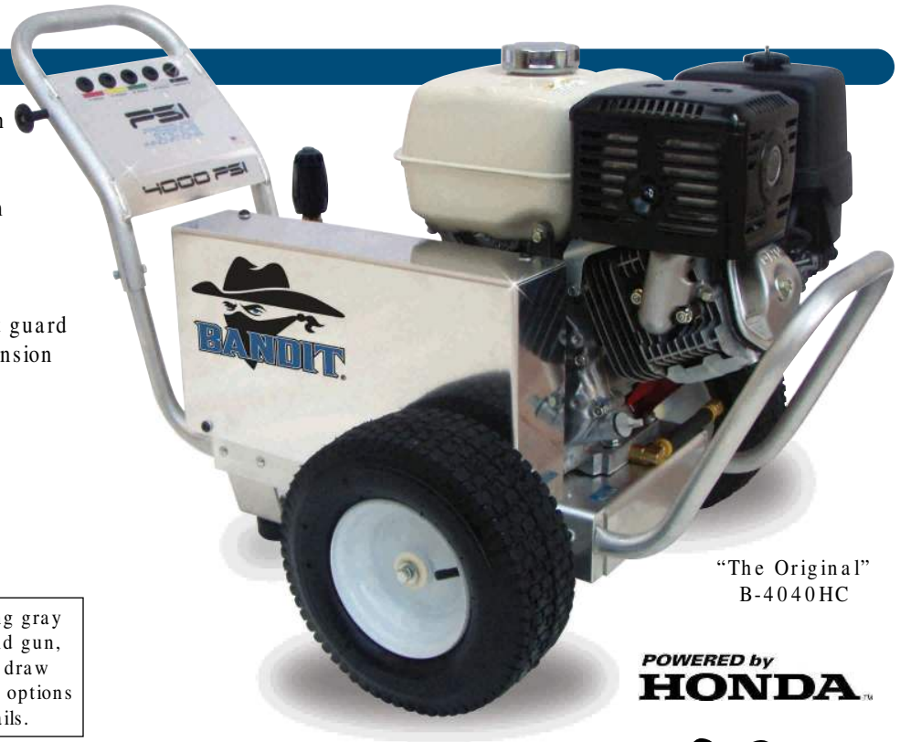
"The Original" B-4040HC

Units include 50' steel braided non-marking gray hose, 36" spray wand with molded grip and gun, 5 quick connect spray nozzles, and a high draw chemical injector. Hose reel kits and other options are available. See your PSI dealer for details.